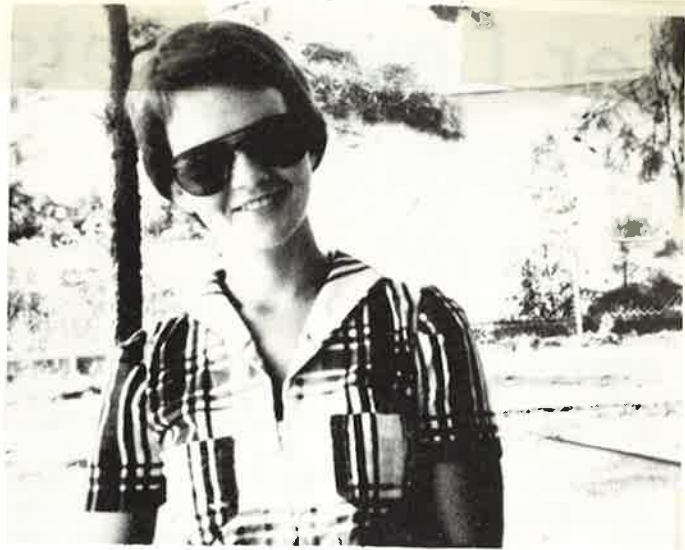
Playwright Connie Cummings